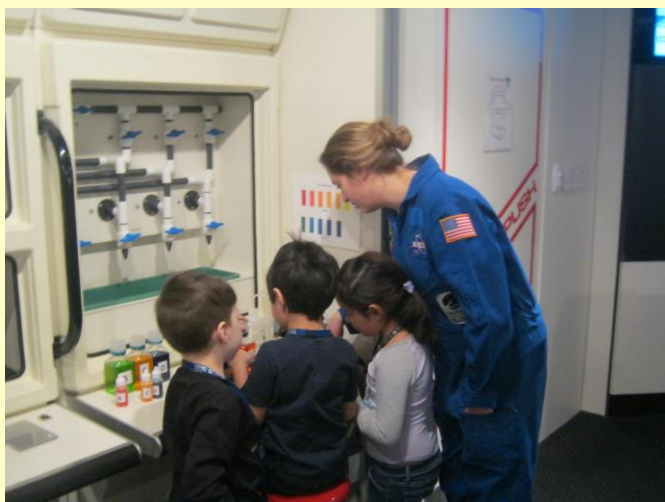
Exploring the Space Station at the Challenger Center

We will continue our exploration of the sky, clouds, and weather. Students will engage in self-reflection as we prepare for our Parent/Teacher/Student Conferences. As our explorations of the sky come to a close, we will work on creating a Sky Book, which will serve as a culminating reflection of our learning. The following week will be filled with weather explorations. It will be a great week!